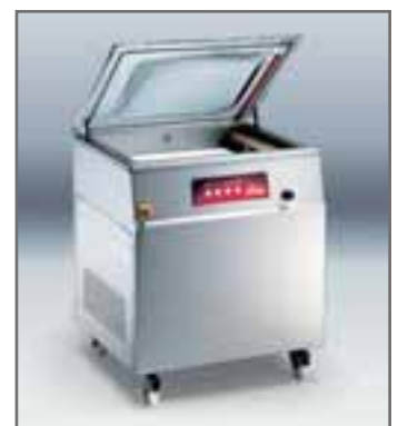
MS4: side sealing bar