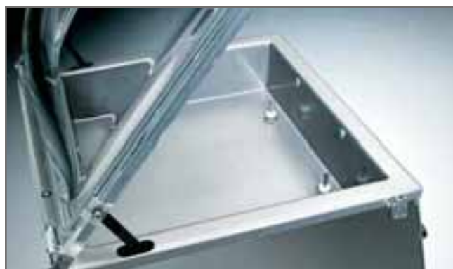
Inside completely covered.