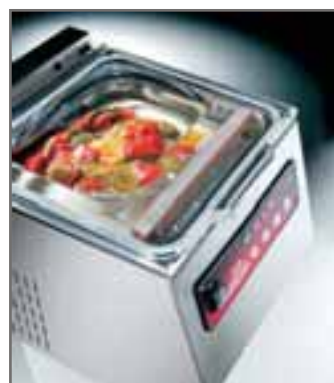
Ms1: packing cycle