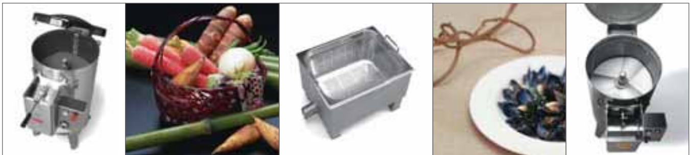
Inside of peeler model